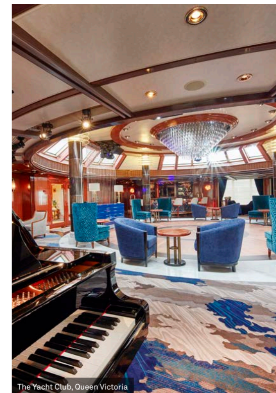
The Yacht Club, Queen Victoria

Named after one of the most popular rooms aboard the legendary QE2, the Yacht Club aboard Queen Elizabeth is a magnificent room with beautiful nautical features and striking panoramic views out to sea. This room can accommodate up to 50 guests.