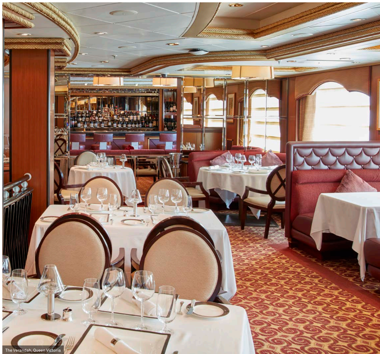
The Verandah, Queen Victoria